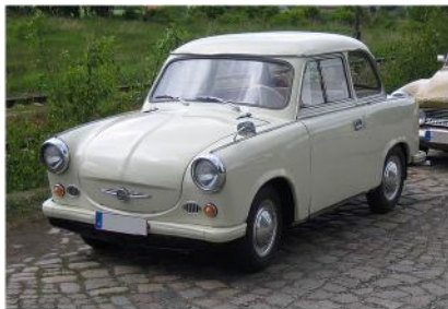
The famous "Trabi"

The topics lie outside of the standard curriculum, such as East Germany (=DDR), China from Mao to Xi, the US civil rights movement and today's struggle for equality, or how Kosovo gained independence. The idea is that you learn about history topics not covered in the standard history lessons.