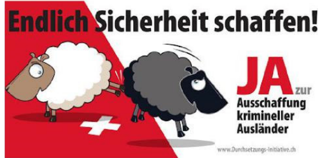
SVP poster 2018