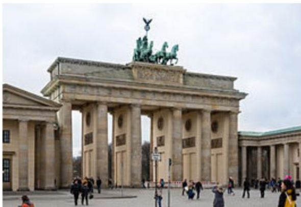
Brandenburg Gate in Berlin

The curriculum demands the visit of historical places on excursions. To study East Germany (DDR) we will go to Berlin, for the United Nations (Conflicts and Intervention) we will go to Geneva, each for several days. The archive work will take place at the University of Basel.