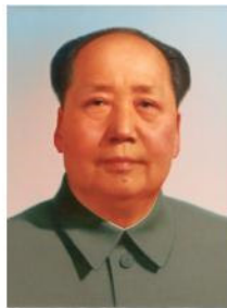
Mao Tse Tung