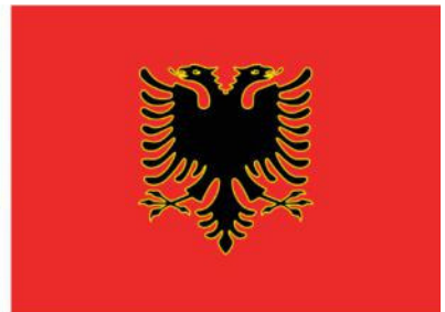
The flag of Kosovo