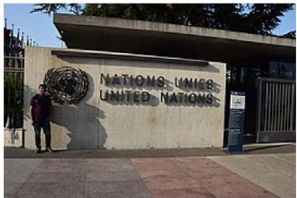
UN headquarters in Geneva