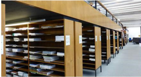
A newspaper archive

You will learn how archives work, to find sources and to analyse them, how to recognise and interpret propaganda such as current election posters or World War I Propaganda and how filter bubbles work in times of “alternative facts”.